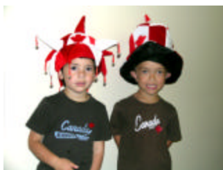
Two little visitors in patriotic hats.